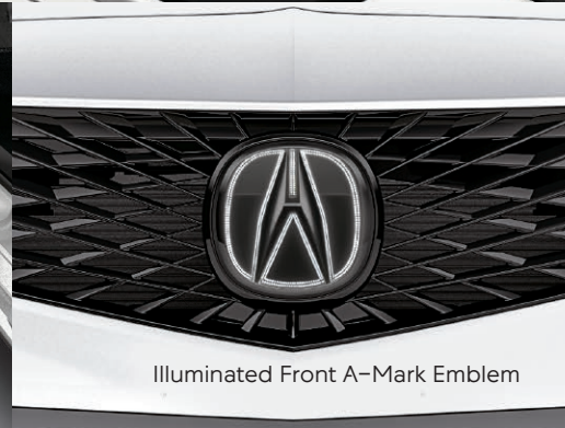
Illuminated Front A-Mark Emblem