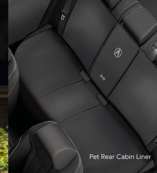
Pet Rear Cabin Liner