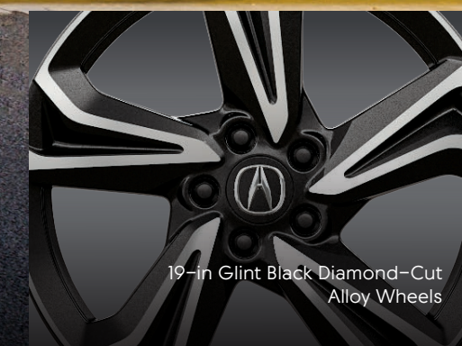
19-in Glint Black Diamond-Cut Alloy Wheels

Integra A-SPEC Tech shown in Liquid Carbon Metallic with Carbon Fiber Door Mirror Covers, Carbon Fiber Tailgate Spoiler, Gloss Black Emblems, Illuminated Front A-Mark Emblem, Rear Diffuser, Side Underbody Spoiler, and 19-in Matte Black Alloy Wheels with Black Wheel Locks. Some components and colors may vary. Please see your Acura dealer for details.