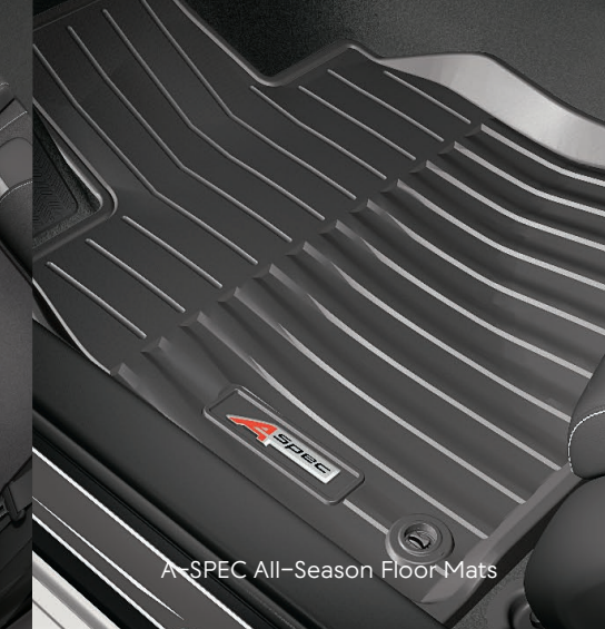
A-SPEC All-Season Floor Mats