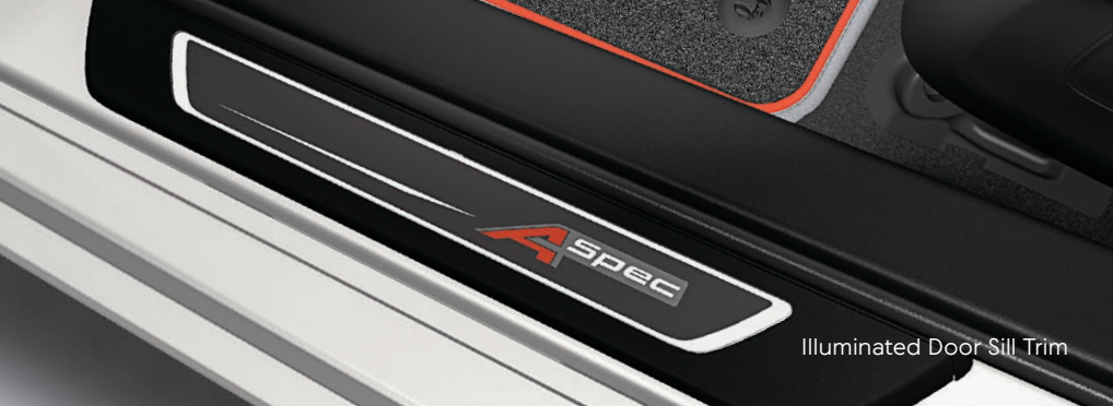
Illuminated Door Sill Trim

Make it yours with Acura Genuine Accessories