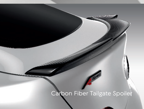
Carbon Fiber Tailgate Spoiler