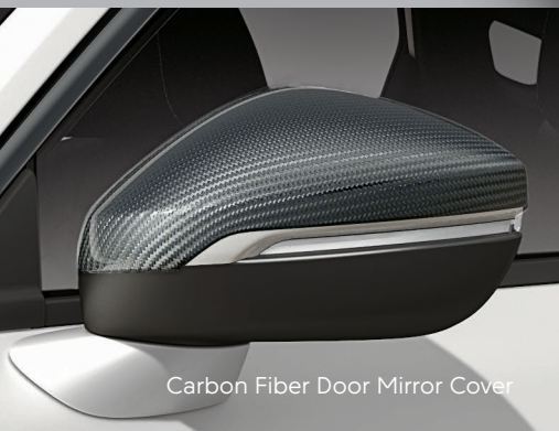
Carbon Fiber Door Mirror Cover